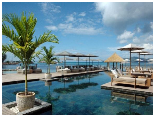
Sea & Pool View

INFINITY POOL BAR – A swim-up pool bar for enjoying refreshments from the cool confines of the pool overlooking the sea.