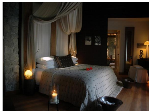
Villa de Charme