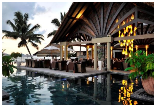
Le Combava Restaurant