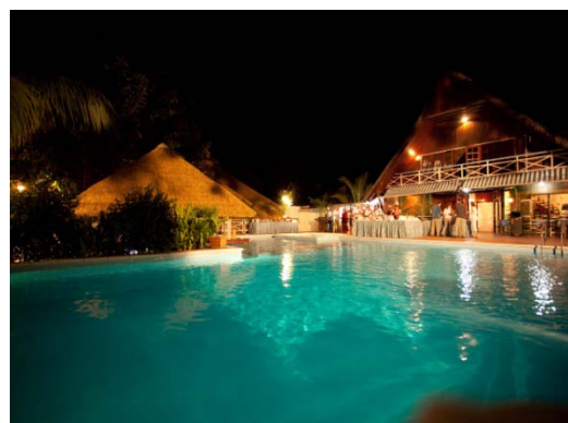
Pool & Restaurant